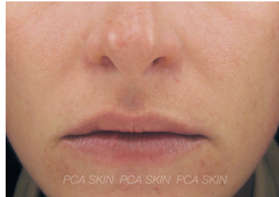
Solution: Oxygenating Trio® and used Facial Wash Oily/Problem, Blemish Control Bar, Acne Gel, Rejuvenating Serum, Protecting Hydrator Broad Spectrum SPF 30, ReBalance.