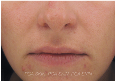
Condition: Acne and diffuse redness.*